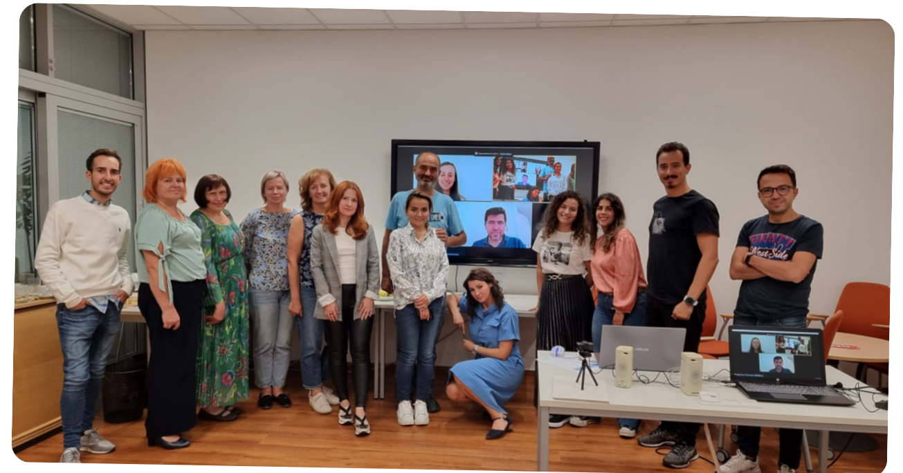
Third Transnational Meeting of Projects in Prague, Czech Republic

In addition, we will have the Digital Guidetool, with this tool, teachers will be able to find the type of tool they can use for their