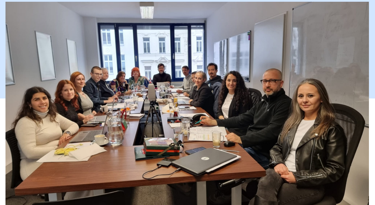
Fourth transnational meeting of the project in Vienna, Austria

We are currently between IO2 and IO3 of this project, we have finished the part related to the videos, they are translated and are being uploaded to the website to be able to start the piloting of the project that will take place in the next months of April and May.